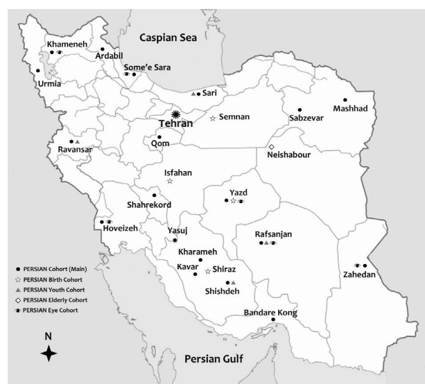
Figure 2. PERSIAN Cohort Sites Throughout Iran. The Cohort sites have been chosen to include all the major ethnicities and geographical areas within Iran to capture different exposures.